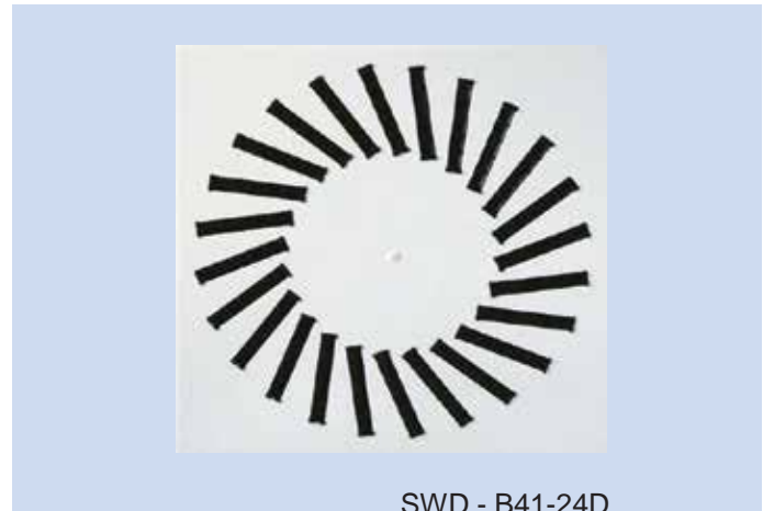
SWD - B41-24D